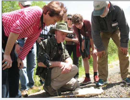
Exploring together along the Southern Laguna Discovery Trail.

and borrowed meeting rooms in the late 1990s has blossomed into a program of year-round opportunities designed to appeal to diverse members of the community with a variety of experiences and topics, attracting thousands of people each year. The opening of the Laguna Trail in 2012 (by the Sonoma County Agricultural Preservation and Open Space District and the Sonoma County Regional Parks), plus the opening of the Laguna Environmental