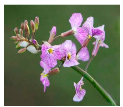
(Wild Raddish,)

The Laguna Foundation invites both beginner and experienced photographers to submit images to our special 25th Anniversary Photography Contest and juried exhibit: A Photographic Journey through the Laguna de Santa Rosa.