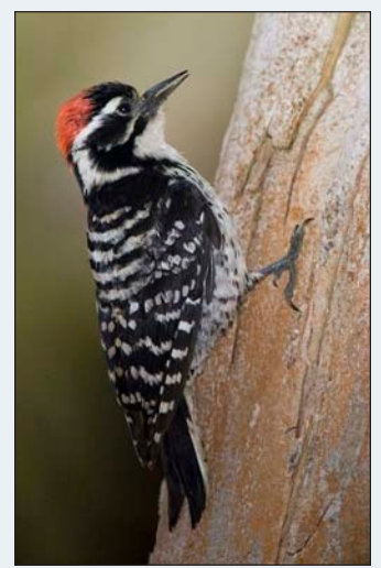
Male Nuttall's woodpecker (Dryobates nuttallii)

"Hey, is that a Nuttall's Woodpecker or a Downy? And wait, could that song have been a Lazuli Bunting? That would be a lifer for me!"