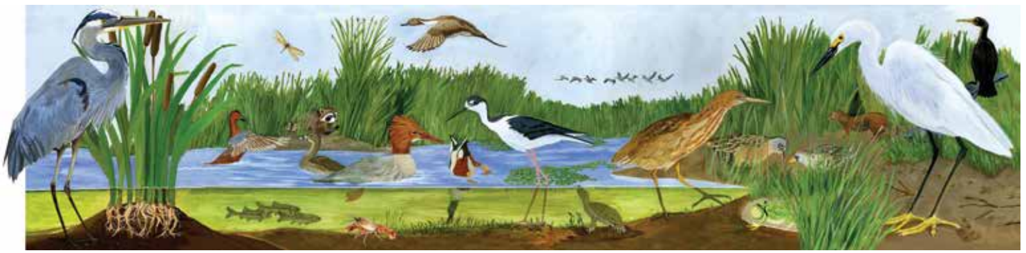
"Wetlands" by Faith Rumm.