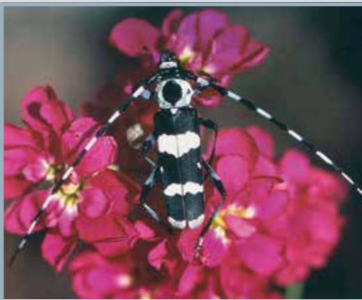
Banded Alder Borer Beetle.