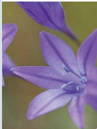
Brodiaea elegans .

Think of how important pollinators are to our food crops, fish to our economy, and forests to healthy air and soil. If the ecosystems that support pollinators, fish, and trees maintain high levels of biodiversity, they are better able to adapt to extreme weather like fires and floods, or human-caused stressors such as habitat destruction and invasive exotics. This means they're more likely to continue providing us with what we need: food, economy, etc. I believe that Nature is valuable and worthy of conservation simply because it exists; but, we should also remember that it also allows us to breathe, eat, drink, and live.