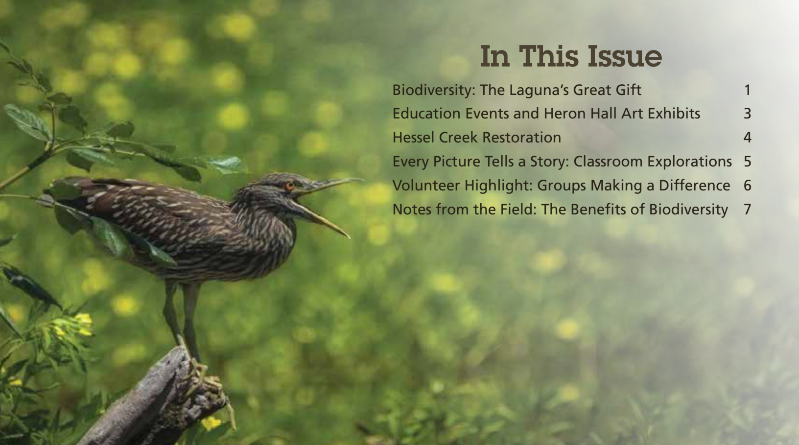
Juvenile Green heron (Butorides virescens).