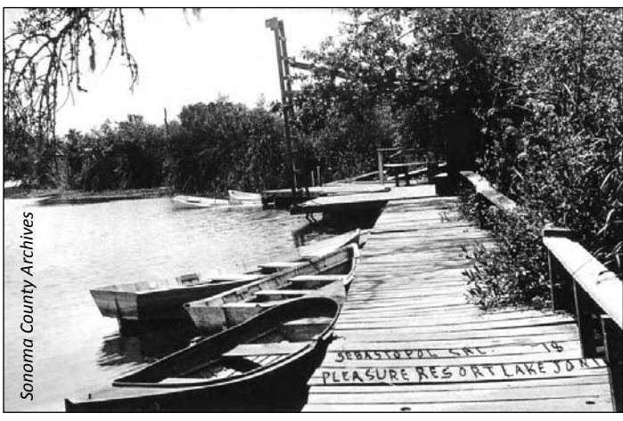
The now-drained Lake Jonive once attracted residents and tourists alike.

Each of these entities has a different set of management goals and public access policies, but they are all dedicated to the preservation of natural resources.