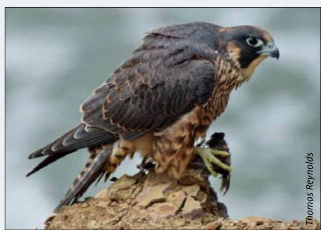
A Peregrine falcon (Falco peregrinus) perches with its prey.

A rust-colored bobcat hunting a hillside meadow east of Santa Rosa in Hood Mountain Park, Sierran treefrogs in Cotati so loud I can't hear my cell phone ring, and two Peregrine falcons diving on waterfowl over a wetland in Sebastopol – I've been privileged to witness all these sights since our last Meanderings, and am so impressed that each was within the Laguna's 254-