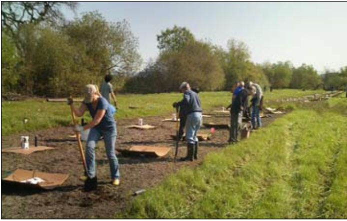
Much of the work done in the Middle Reach is completed with the help of the Laguna Keepers, an all volunteer group that works one Saturday a month on projects around the Laguna wetland complex.