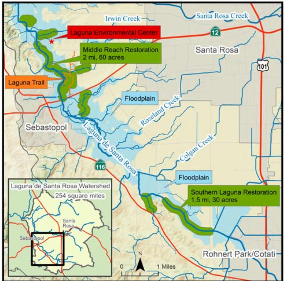
Map details: 3.5 miles (90 acres) of completed riparian restoration along the main Laguna channel and tributaries. Current restoration includes 10 additional acres in the Middle Reach Project.