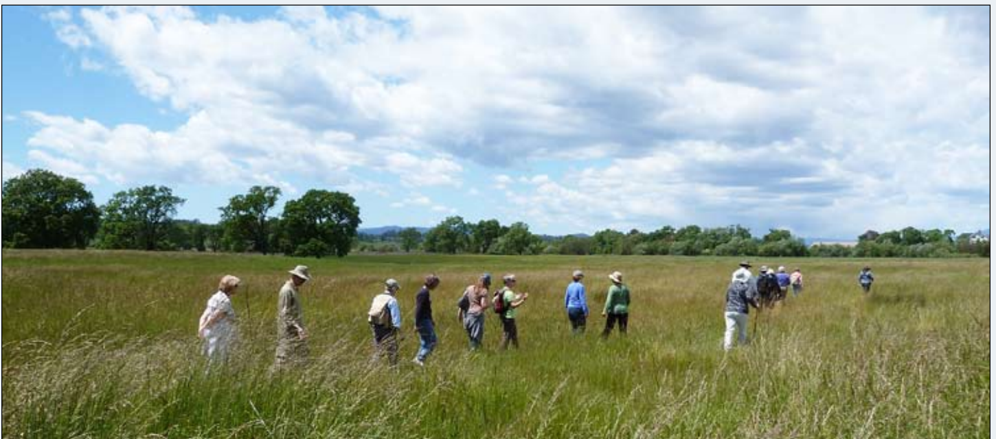
Visitors of all ages come to appreciate and hike the magnificent Laguna Wetland Complex.