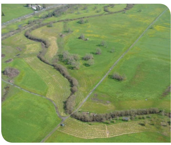
The mowed lines at the Gravenstein Creek project, March 2017, show the new riparian buffer.

At Gravenstein Creek we are planting over 4,000 native trees, shrubs, grasses, sedges and understory plants to form a 100'-wide vegetated buffer on both sides of the creek, adding 10-acres of "new" riparian forest. The surrounding fields support the ongoing hay farming operations on the City of Santa Rosa's Brown Farm that use reclaimed water. The plants in the riparian buffer will uptake nutrients from the reclaimed water.