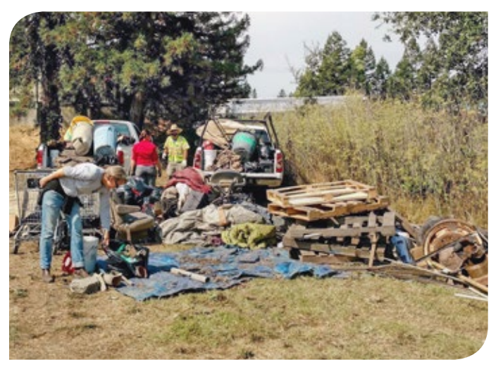
Staff and volunteers collected enough trash along Zimpher Creek in one day to fill three truckloads!

More than 60 hearty volunteers joined our annual Great Laguna Cleanup (Part of Coastal Cleanup Day) on Saturday, September 16, in the Laguna Wetlands Preserve in Sebastopol. We covered a quarter mile of the Americorps Trail and picked up enough trash to fill three brimming truckloads plus another large pile of recyclable material. Through this annual effort, we ensure trash is picked up before the rain starts falling and trash washes into our waterways and ocean. This event is a fantastic reminder that each of us, all ages and abilities, can do small but important things to help clean up our Laguna waterway.