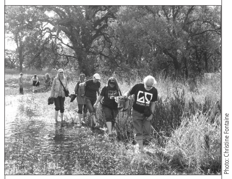
Laguna walk participants passing through a swale.

We look forward to an expanded offering of public Laguna walks in 2010. In addition to our annual Delta Pond Rookery walk in early May, and a Sebastopol Walks! outing in the summer, we are also entering into a new partnership with LandPaths and the Sonoma County Agricultural Preservation and Open Space district for guided walks on Laguna properties with Open Space easements. Keep an eye on our e-calendar for spring opportunities to investigate, learn and deepen your connection to the Laguna.