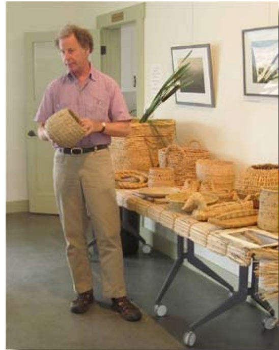
Tule Basket-Making Workshop, July 2012