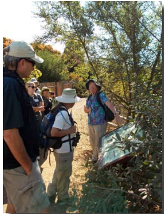
Laguna Headwaters Walk, September 2012