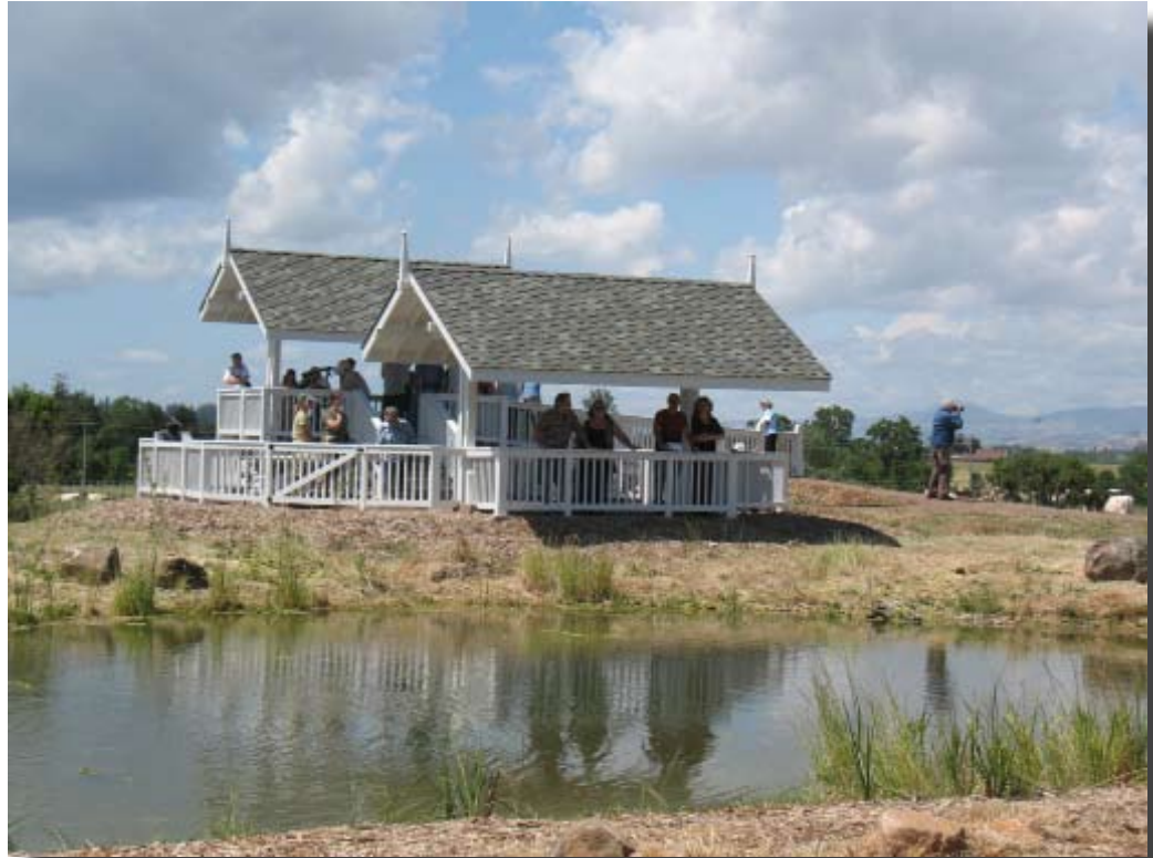
Grand Opening Celebration of the Laguna Environmental Center, May 2012